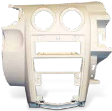
DuraForm PA Dashboard