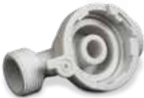
Hose fitting printed in DuraForm ProX GF