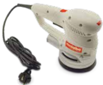
Sander tool housing printed in DuraForm PA material