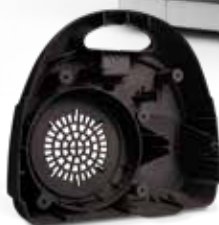
Back cover of vacuum cleaner printed in DuraForm EX Black