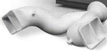
Manifold printed in DuraForm ProX FR1200